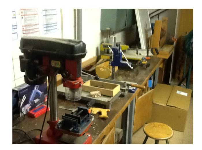
Wood Work Room