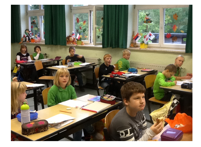
Year 5 - 10/11 year olds