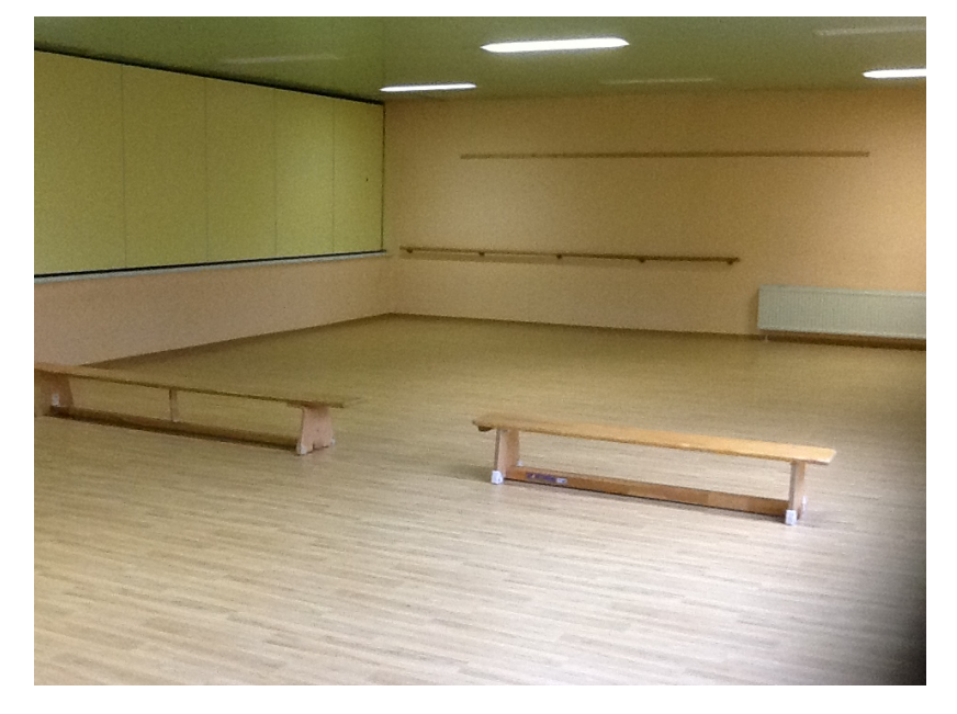
School also has a Dance Studio / Gymnastic space.