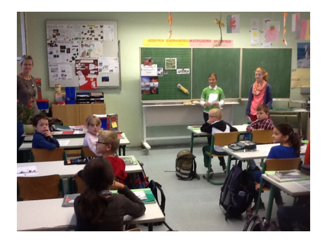
Year 4 - 8 year olds