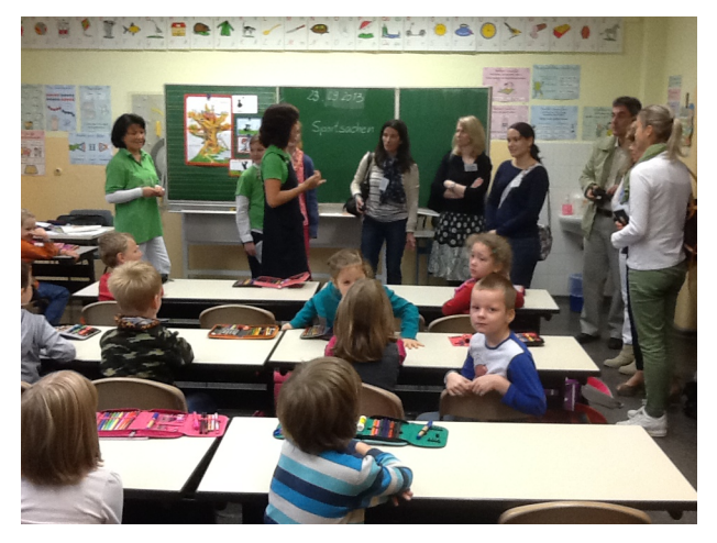
Year 1-2 Class 2