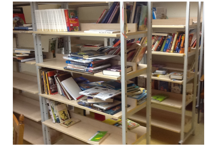
Library - Developmental Stage