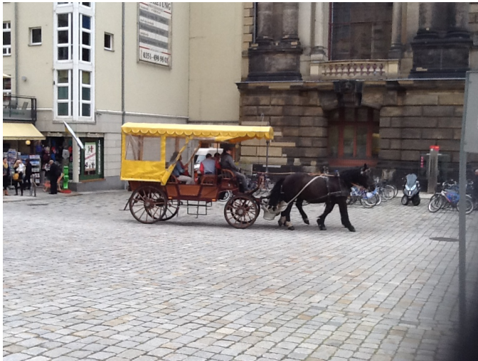
Outside the Church in the Square