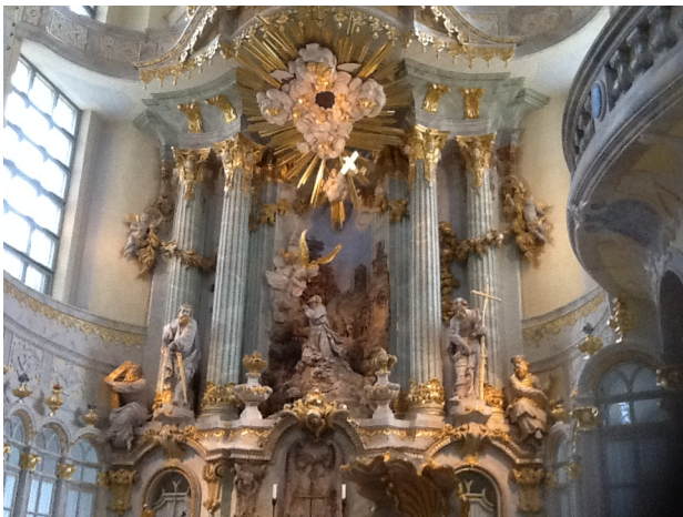
Views inside and from the top of the Tower Stunning