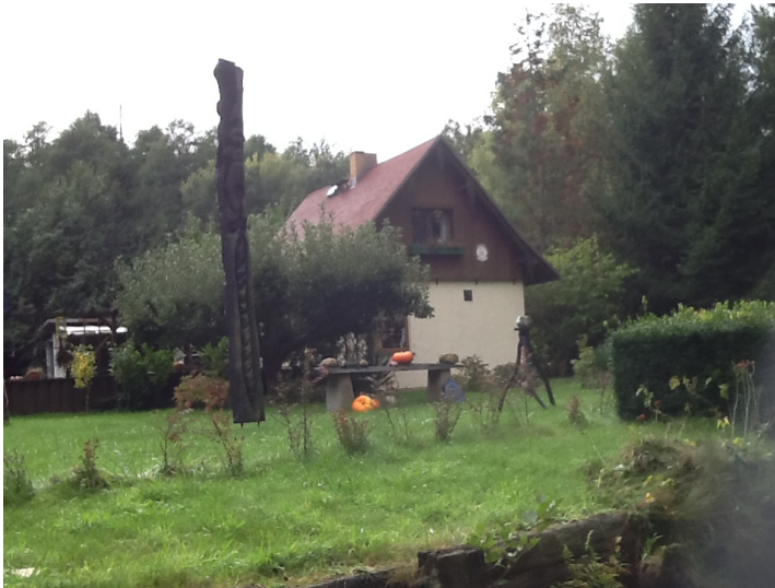
Private House - Built by owners and they had to bring all materials by boat.